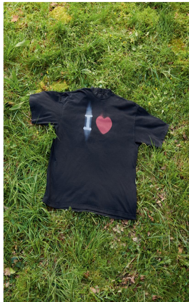
Figure 9. Balenciaga, I love campaign (Jin Daily, 2023)