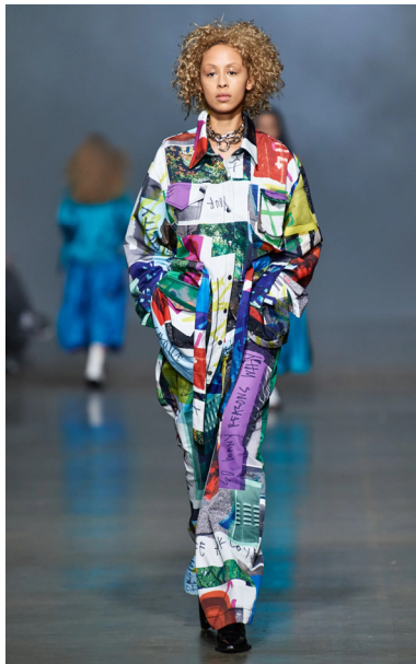
Figure 6. Communication, Marques Almeida, Fall 2020 (Nast, 2020)

Loewe, known for its storytelling prowess, incorporates narratives into its creations, infusing depth and meaning. The brand’s recent focus on nature and sustainability is evident in its 2023 Spring Menswear Collection. This collection draws