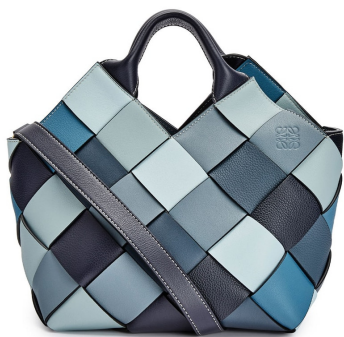
Figure 10. Loewe, Surplus Project (Loewe, n.d.-b)

Y/Project demonstrates its unique interpretation of recreation through an innovative design approach applied to everyday wear items. Their technique involves merging