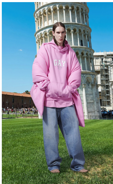
Figure 5. Playfulness, Balenciaga, Pre- Fall 2021 (Nast, 2021)