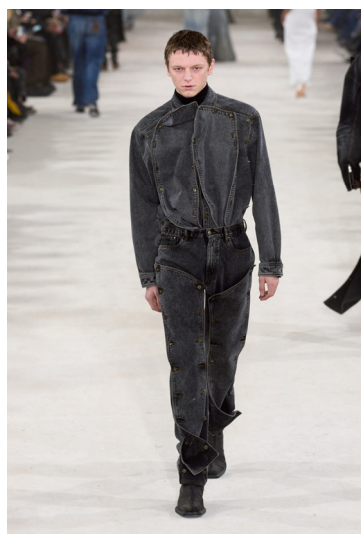
Figure 11. Y/Project, Fall 2022 (Leitch, 2022)