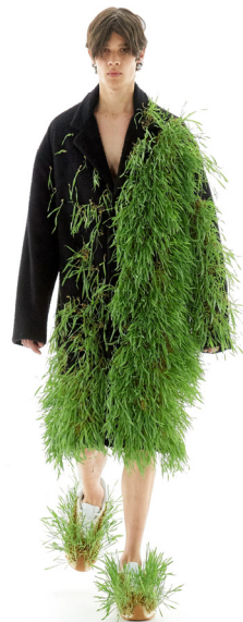
Figure 7. Communication, Loewe, Spring 2023 (Mower, 2022)