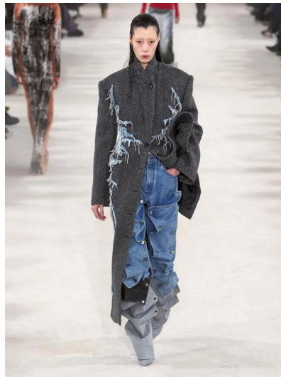
Figure 3. Recreation, Y/Project, 2023 Fall (Y/project, n.d.-b)