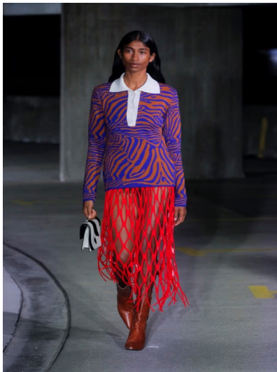
Figure 2. Playfulness, Marques Almeida, 2023 Spring (Garcia-Furtado, 2022)

The pursuit of new values is characterized by the active discovery of a new generation’s youth culture that rejects the