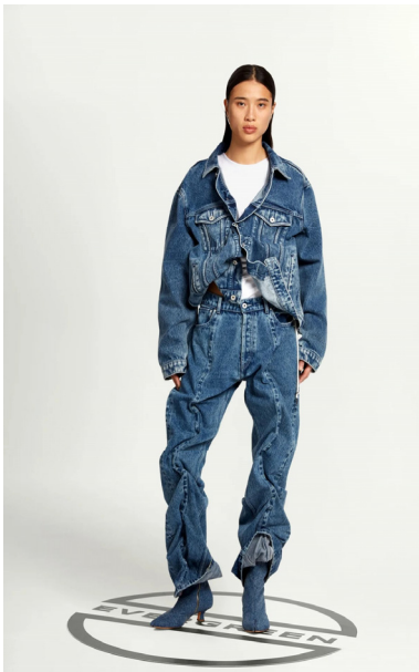
Figure 8. Evergreen (Y/Project, n.d.-c)

Balenciaga blends uniqueness, creativity, and contemporary trends with global issues, creating avant-garde designs that challenge fashion norms. While rooted in high fashion traditions, the brand redefines them to align with modern values, including sustainability. Occasionally these collections bear messages that resonate with contemporary values, creating conversations about modern issues. Their design philosophy incorporates characteristics of Millennials and Gen Z, empowering customers' individuality. A notable example is the 520 collection, referencing Chinese Internet Valentine's Day, a phenomenon embraced by Gen Z. The collection bears the slogan "I Love Earth," coupled with a distinctive graphic featuring the phrase "I love" accompanied by a smudged heart emblem. Consumers can personalize the garments using a provided marker, appealing to Gen Z's self-expression and Balenciaga's playful style (Fabris-Shi, 2023) (Figure 9).